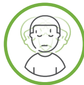
Loss of balance