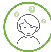
Confusion, trouble speaking or understanding